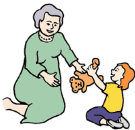
Young children and seniors