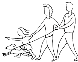
Healthy active people who spend time outdoors, especially on hot days.